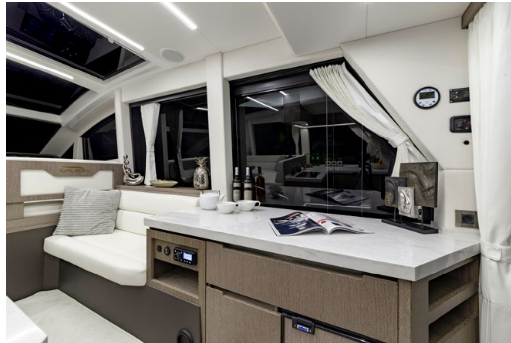
The large windows slide forward opening up the interior! —