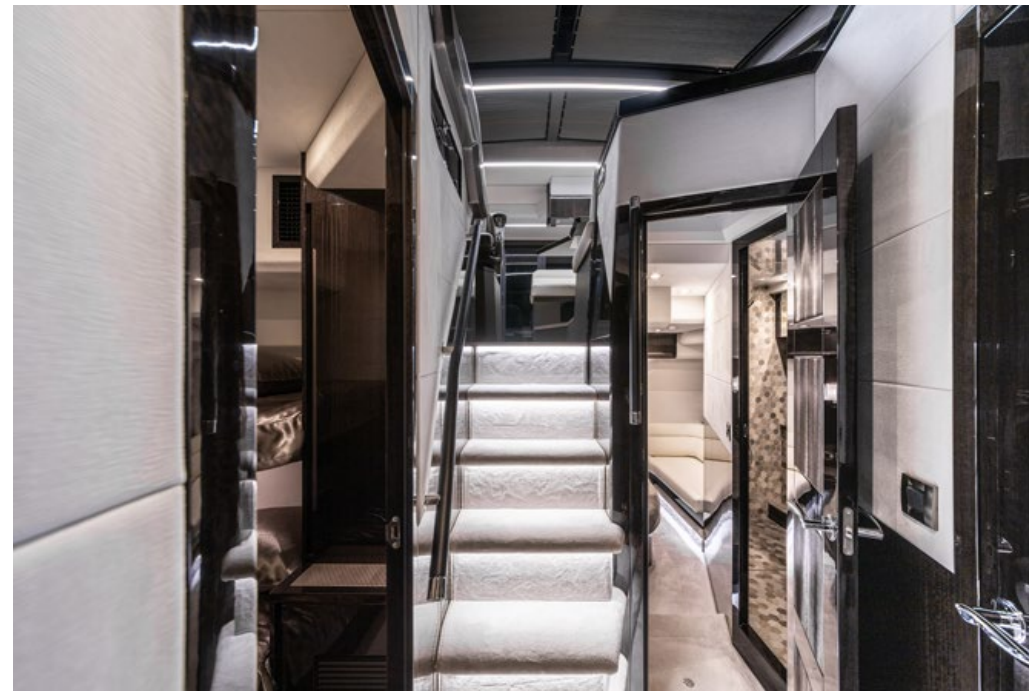
Three cabins down below for a total of six berths —