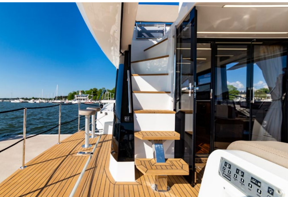
— With the Beach Mode down the cockpit space is amazing