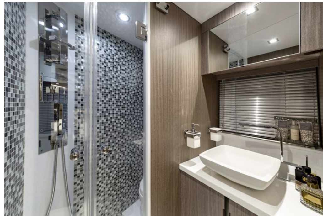
Two bathrooms are located below deck —