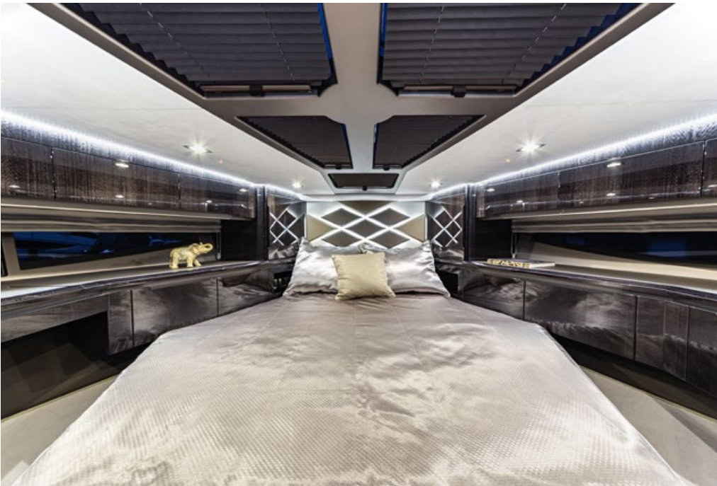
Front VIP cabin with large glass panels above —