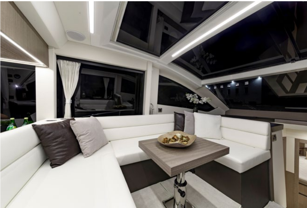
The dinette and rest area, notice the large sunroof above —