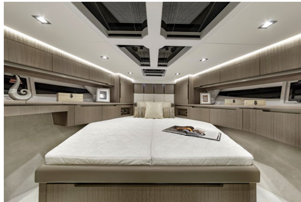
The forward VIP cabin with skylights above —