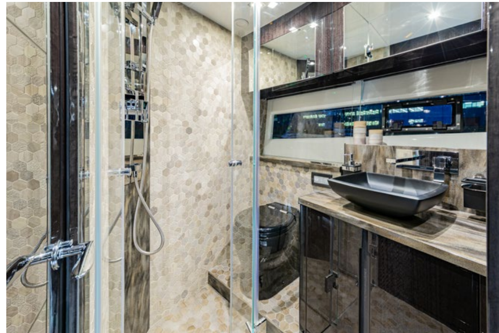
High quality custom fixtures —