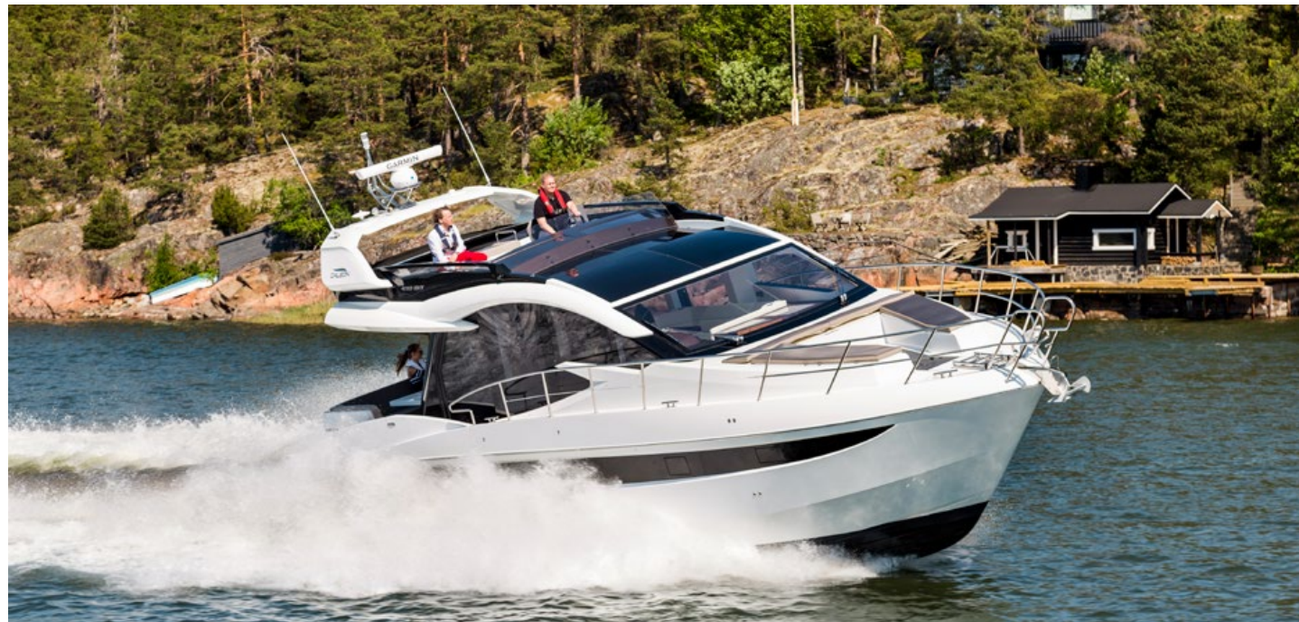
Great handling of the sport-oriented 470 model —