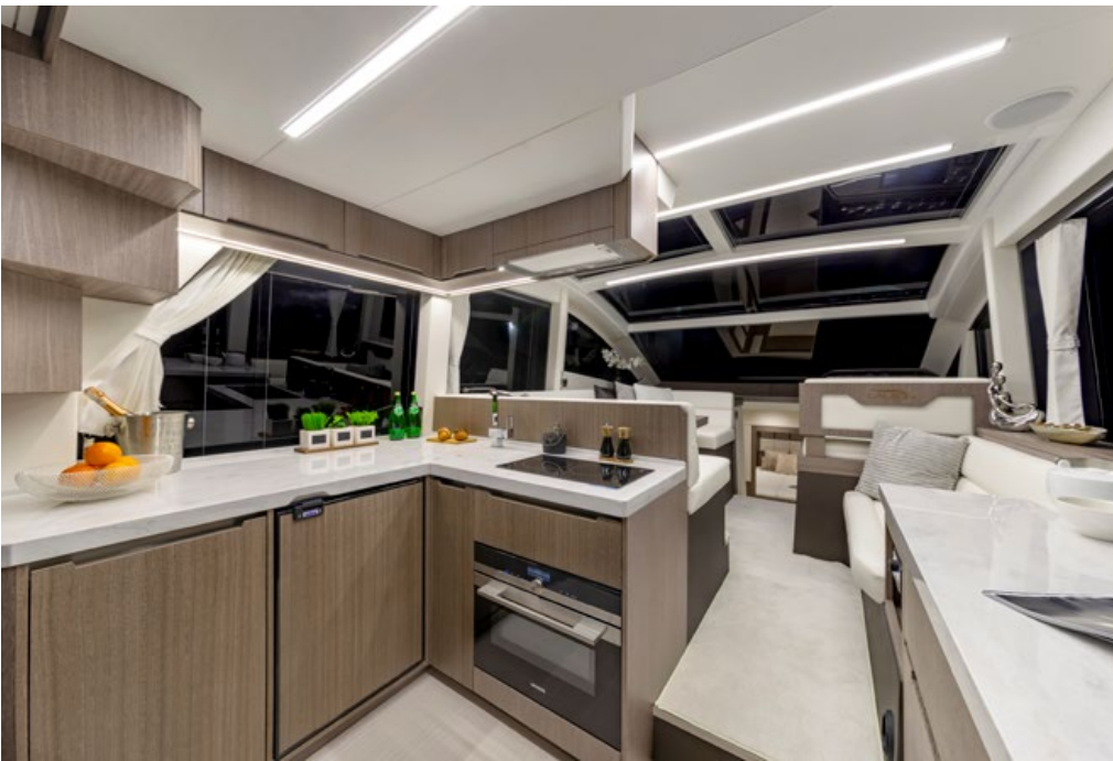
A well equipped galley is moved back —