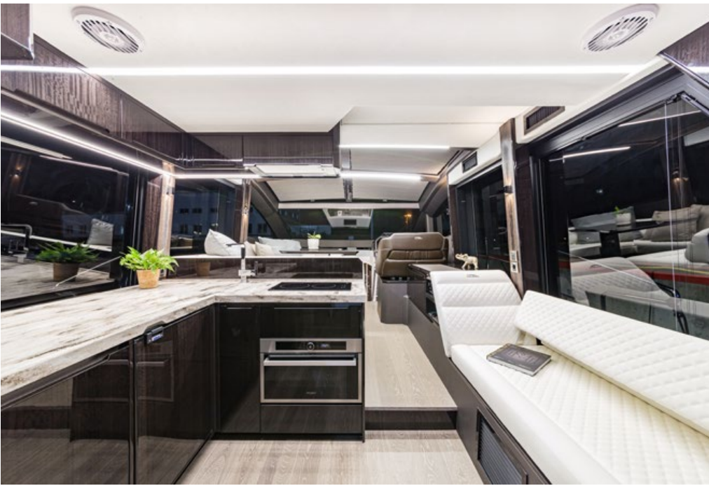
The galley is located back and offers a large worktop —