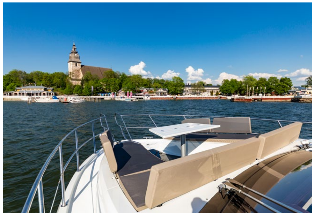
— Bow rest area with a pop-up table