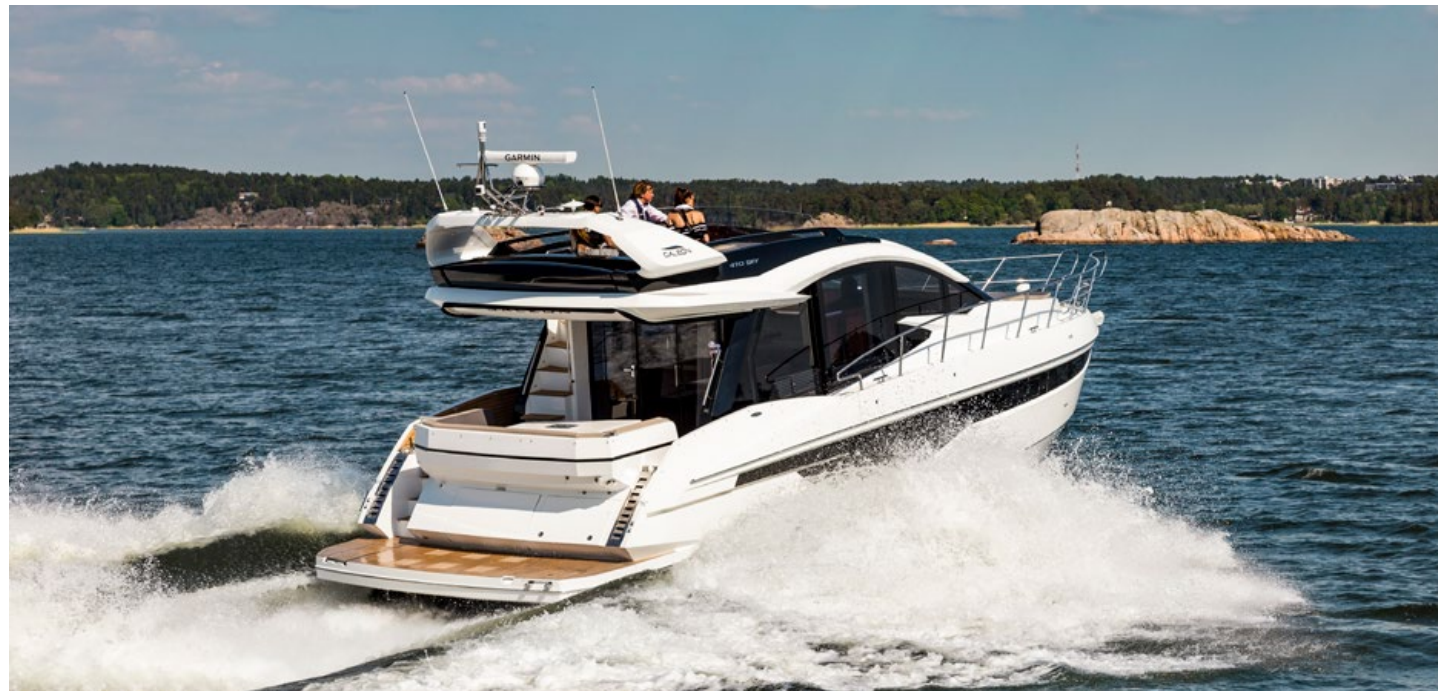
Various cockpit options are available including a roto-seat —