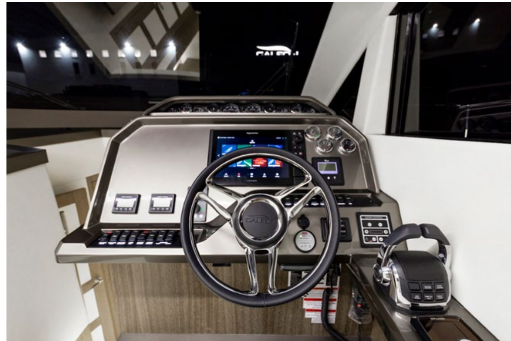
Take control of the yacht from the helm on the main deck —