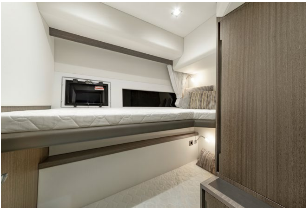
Bunk beds in the guest bedroom —