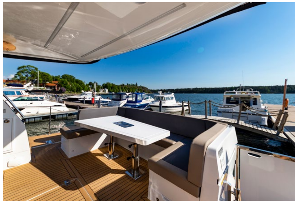
— Large cockpit for al fresco dining