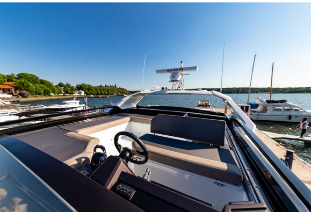
— The top deck can be closed off with a soft top roof