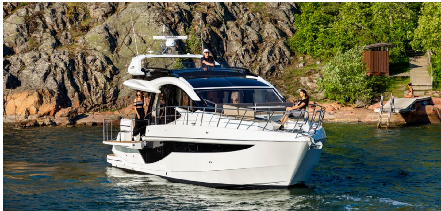
The Bow rest area offers proper seats with back support! —