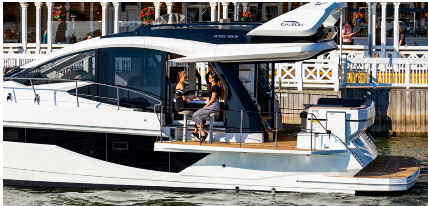
Serve drinks to the outside bar on the port side —