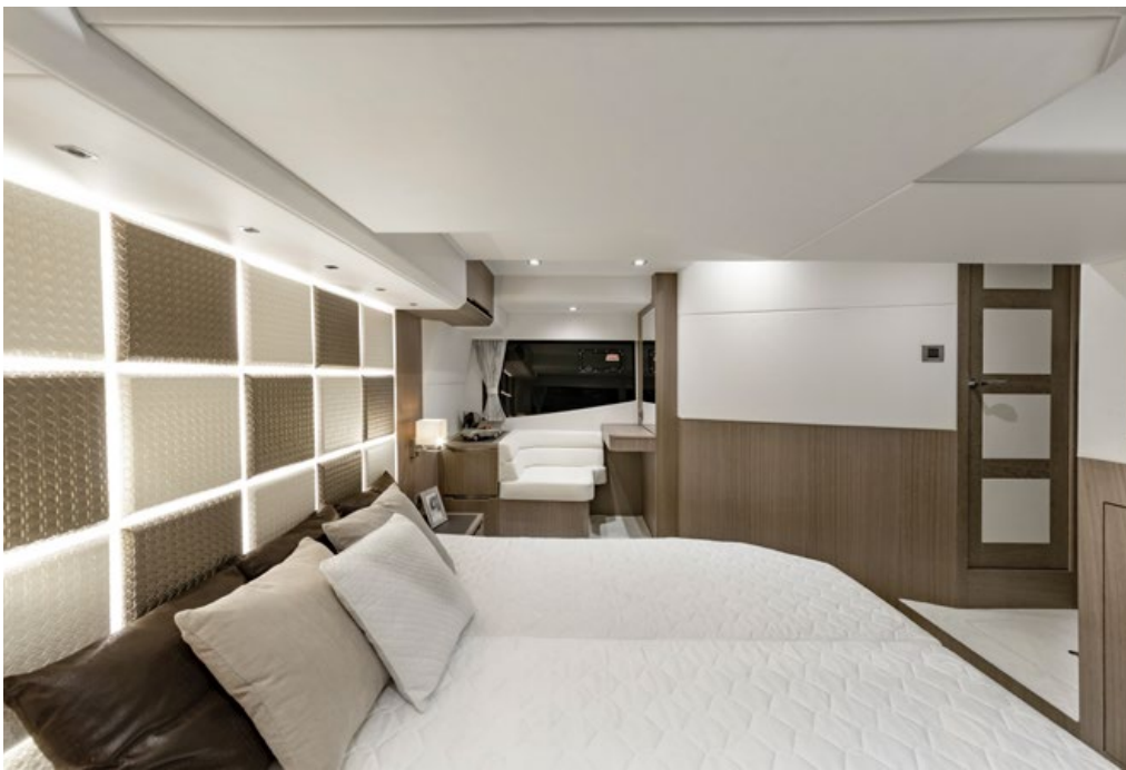
The owner's cabin offers a private bathroom for comfort —